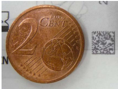
DM-Code in comparison to a 2 Cent coin